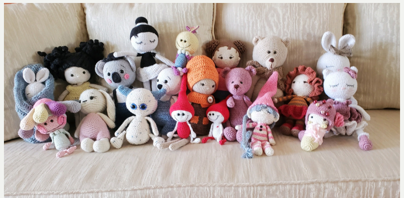
HANDMADE DOLLS FROM ESTONIA.