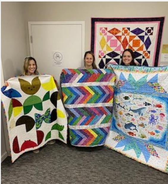
QUILTS RECEIVED BY ONE PLACE EMPLOYEES.